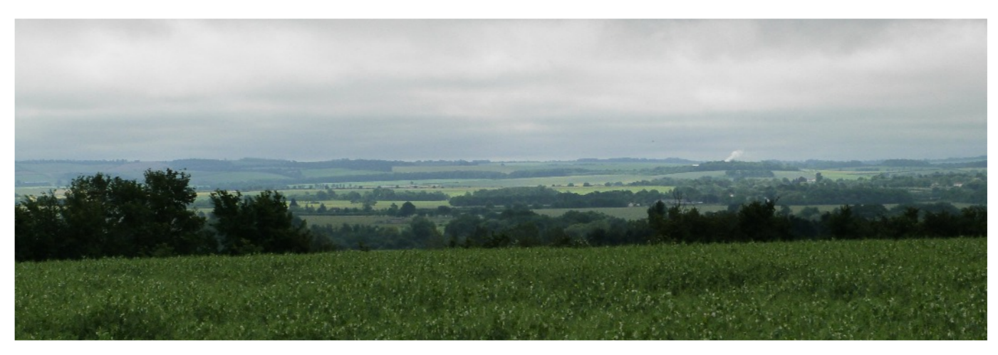
View to South-west from path above New England Farm

fence and a seven bar gate, but whatever it is for is never at home. Deer can often be seen grazing on the edge of the wood ('New Forest') below Top Farm. Turn right down the track to the Main Road.